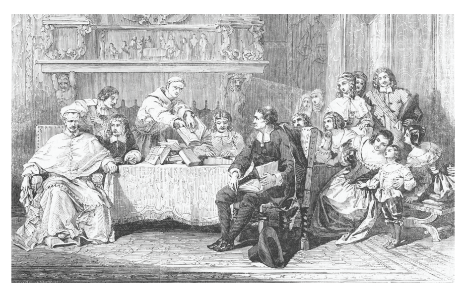
Fig. 3: Religious Controversy in the Time of Louis XIV (1849) oil on canvas, engraving, Illustrated London News, 1849. Copyright: Trustees of the British Museum.

The Novice Nun gains its anti-Catholic label from the condemnations of cloistered living in the nineteenth century and from the depictions of nuns and convent life by other artists who did exhibit Romanist tendencies,